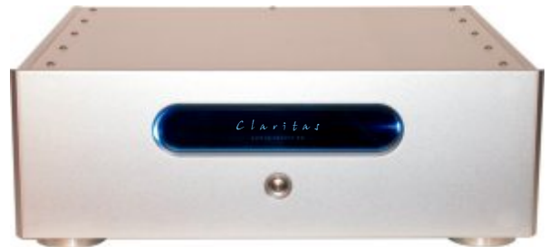
Claritas 390M Silver

Same width as the 260 range (Hi-Fi standard 440mm) but with extra depth to accommodate extra mass storage, 390M accepts MicroATX motherboard with a full size ATX PSU. 390A supports ATX motherboards with a microATX PSU