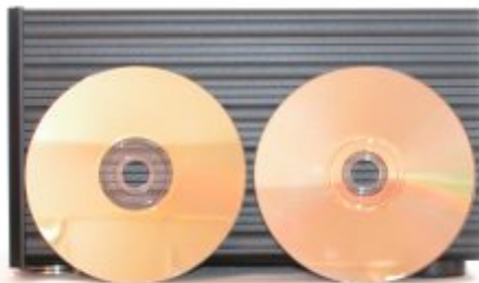
only 260mm deep