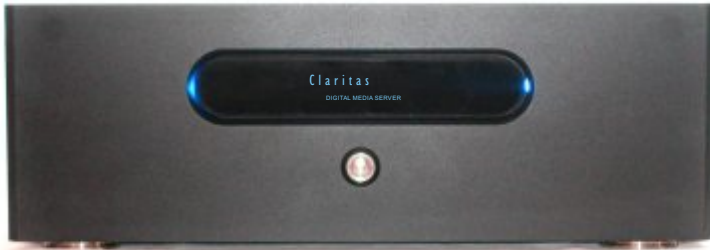
Claritas 260M Black