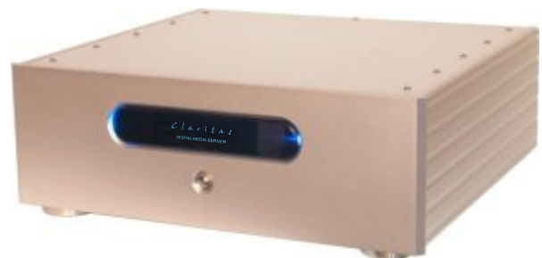
380mm internal depth for ultimate capacity - up to six HDD's

Superior design for efficient ventilation 390M shown above with ATX PSU. The 390A microATX supply is completely housed within enclosure