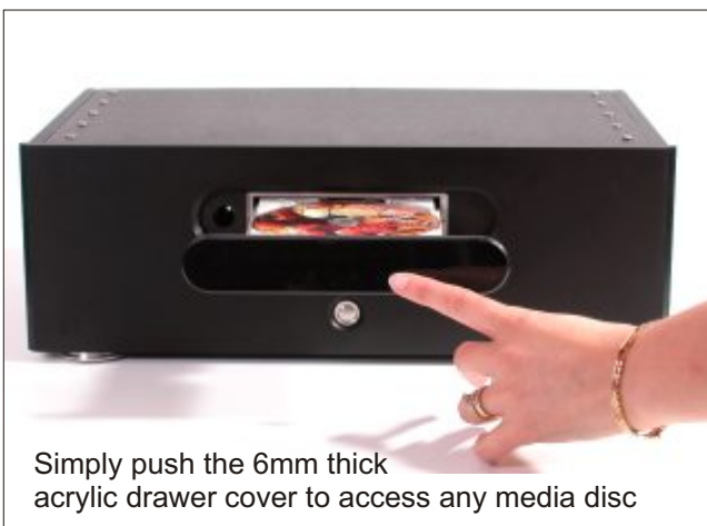
Simply push the 6mm thick acrylic drawer cover to access any media disc

Audio Server - Stream audio all over the home, the list goes on and on.