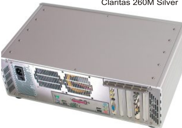
Stainless steel rear panel on all models