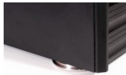
Stainless Steel front feet and fixings to 260 range