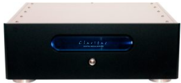
Claritas 390M Black note: casework shown in silver All black is available