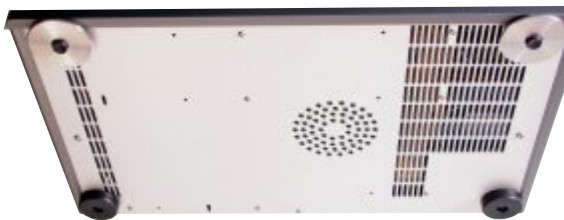
Bottom detail of 260M and 260A