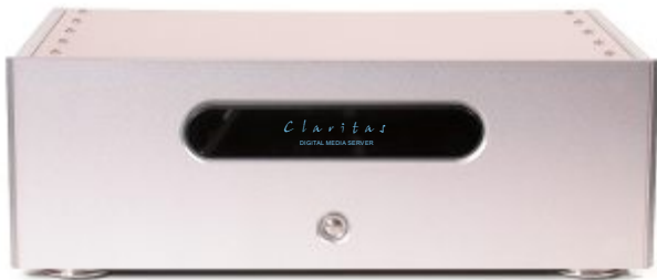
Claritas 260M Silver

Designed for maximum compact dimensions whilst still utilising standard full height PC cards Both models utilise a MicroATX Power Supply Two models available, 260M accepts MicroATX motherboard the 260A accepts a full size motherboard, therefore has an asymmetric fascia.