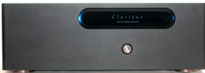
Claritas 260A Black

Due to the minimal depth of 260mm a Micro ATX Power supply must be used currently rated at up to 420w The 260A is available in both silver and black anodised finishes.