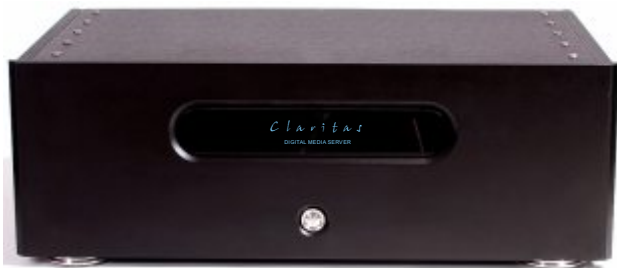
Claritas 260M Black